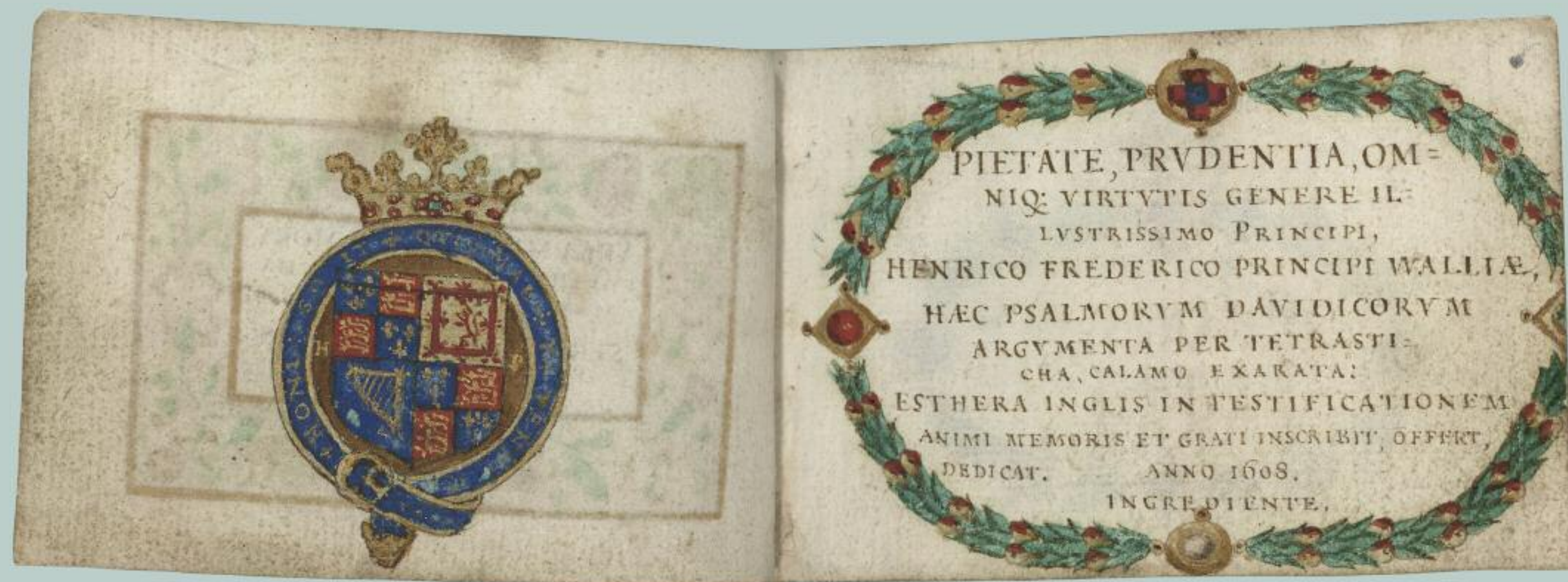
Esther Inglis, Argumenta Psalmorum , 1608. Manuscript. Dedication page with floral border.