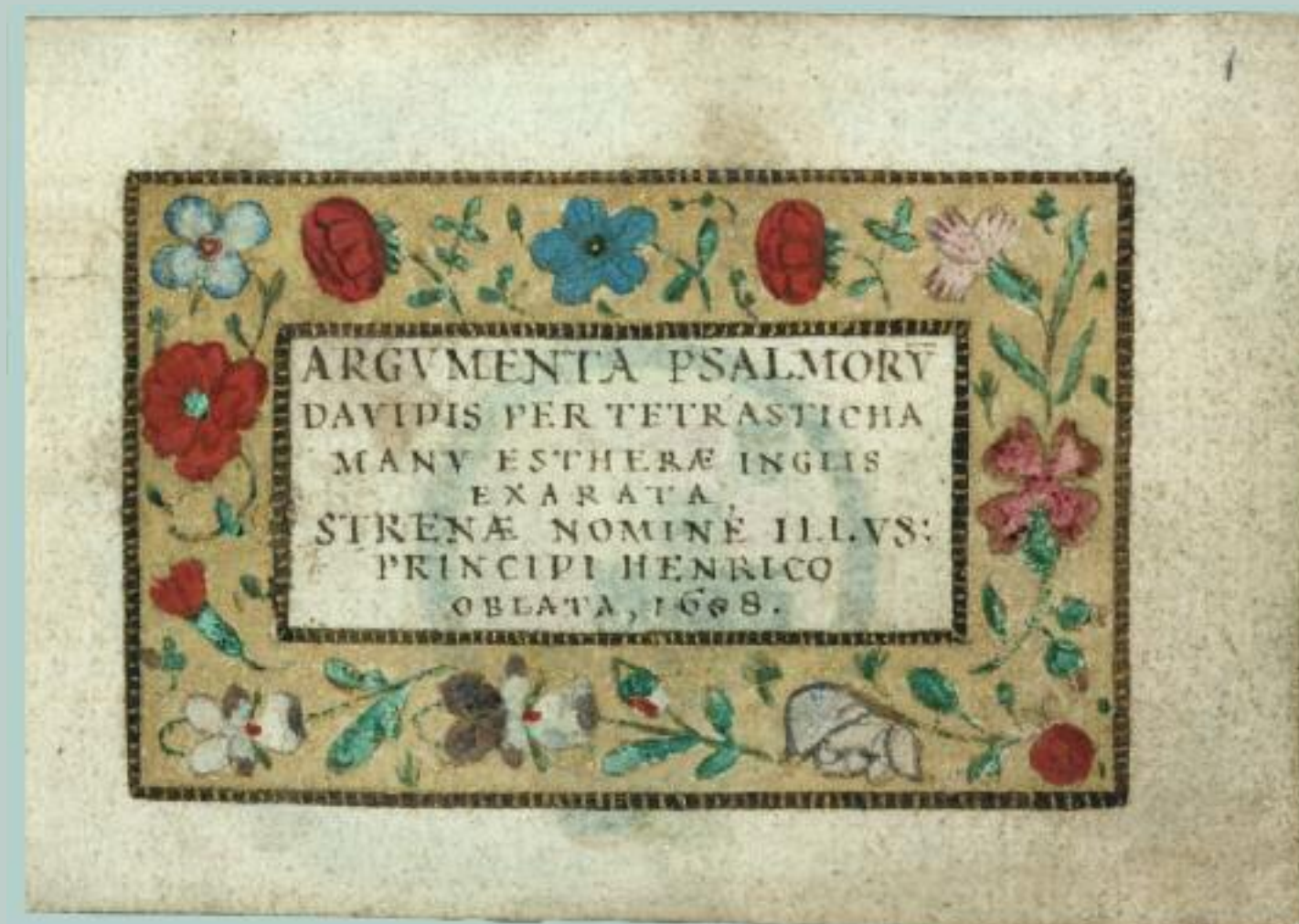
Esther Inglis, Argumenta Psalmorum , 1608. Manuscript. Dedication to Henry, prince of Wales.